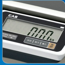
Large LCD display