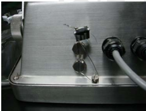
CI-200S and SC Sealing Means