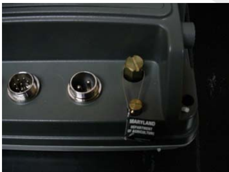
CI-200A and 201A Sealing Means