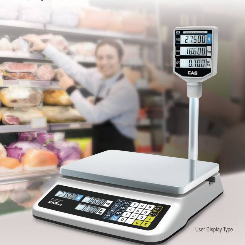
User Display Type

As an electronic price-indicating scale with a maximum of 1/30,000 resolution, PR-II is designed in a low profile to be conveniently used in open market such as butcher's shop and groceries.